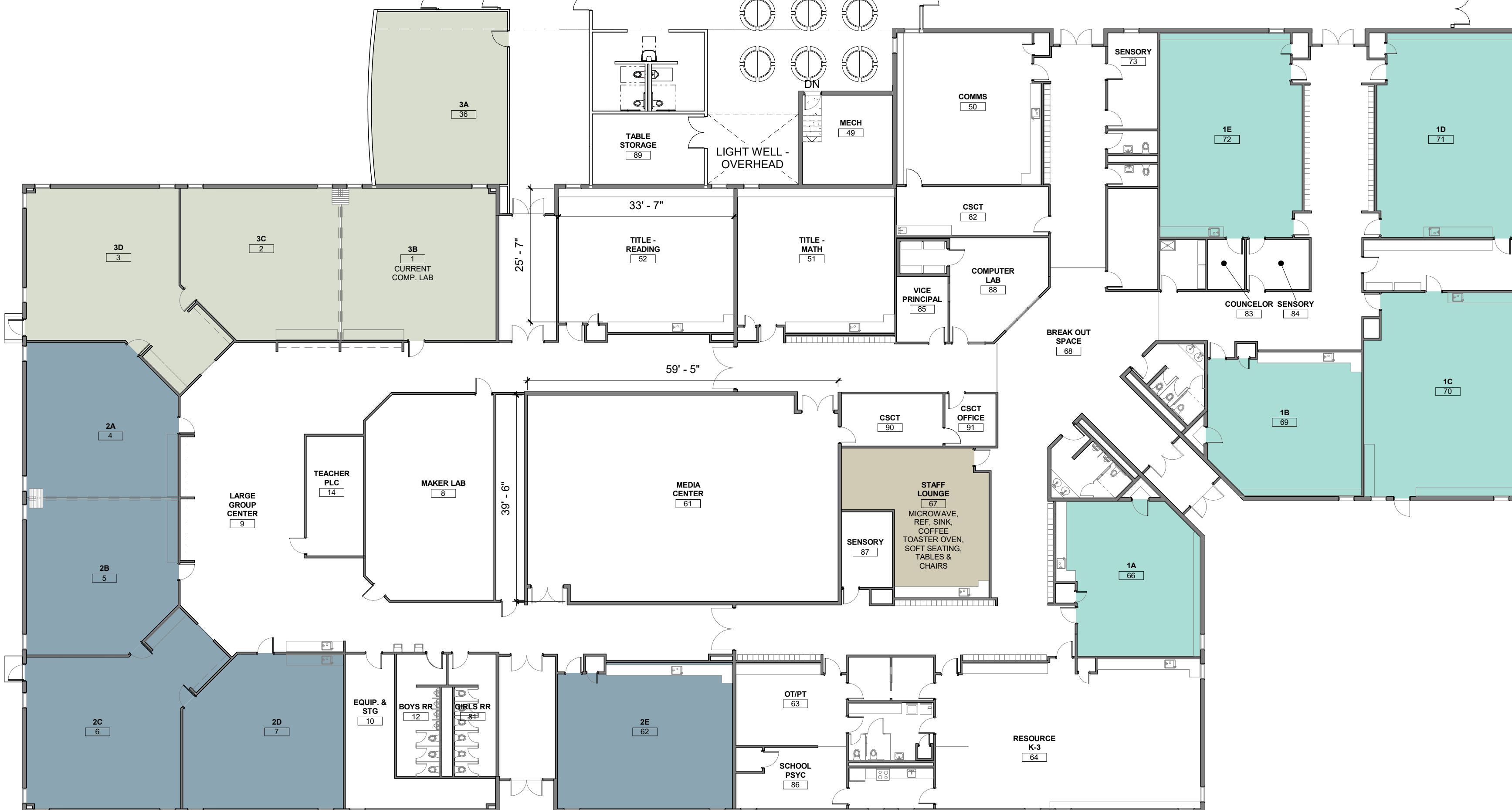
1 LEVEL 1 Overall 1/16" = 1'-0"